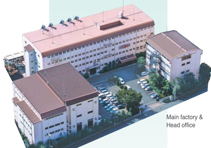
Main factory & Head office